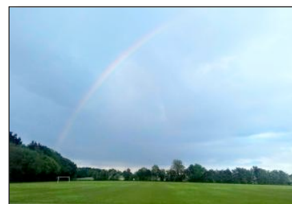
A rainbow over this autumn turned Westwood Park into a green jewel and added extra colour

Chessfield Park entrance was investigated during the summer and blocked drainage pipe was located and cleared. We will continue to monitor to see if this has resolved the flooding problem. ■