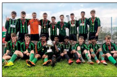
Under-16s cup winners, 2018/19

Such is the success of the club that we now run waiting lists at several age groups. We run age groups from U5 to U17; a total of 21 teams, with many age groups having multiple teams.