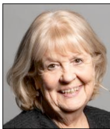
Rt Hon Dame Cheryl Gillan, MP 21 April 1952 – 4 April 2021

Her work for this community over 29 years has been of huge benefit to residents of all political views. Her campaigning against HS2 was instrumental in