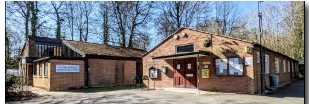
The village hall and community library as they are today

The greatly-valued community library is also getting old, is increasingly expensive to run, and has run out of space to provide all