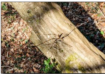
New shoots from ancient hornbeam (left). Sheltering in a tepee (right)

We are pleased to report that our wonderful ancient hornbeam, which was partially uprooted in storms during the past winter, is showing signs of recovery. The tree was