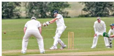
Howzat!! The Chorleywood Cricket Club in action

There are lots of ways to join in – not only playing but umpiring and scoring too, so if you have ever thought of participating, or your daughter or son has and would like to join in, there is a game or role for everyone and you