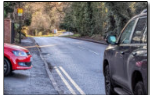
Cokes Lane, above, heading towards Harewood Road, where the new MVAS clearly shows a driver totally ignoring the warning to SLOW DOWN!