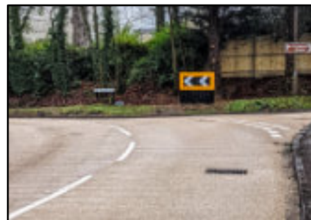
New 'slow' signs and corner warning signs (above) and anti-skid surfaces and new chevrons on Cokes/Nightingales corner (right)

The dangerous corner signs have also been replaced with