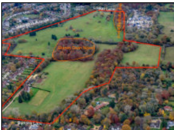
The green belt site proposed for development (boundaries shown approximate), and the ancient woodland affected.

1,085 Little Chalfont residents submitted their own objections to the proposals. In February 2022 the developer sent further information to Bucks Council on environmental aspects of the application. We then submitted comments reinforcing our