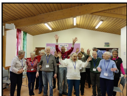
Celebrating the resulting fund from our raffle!

the committee, volunteers and carers hold fund raising activities. There will be a coffee morning in the spring in the Village Hall.