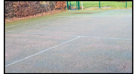
Faded tennis court markings

Because there have, sadly, been incidences of vandalism in the park in the past, the council will be installing automatic number plate recognition (ANPR) apparatus in the car park to ensure that the park is as safe as possible to use at all times.