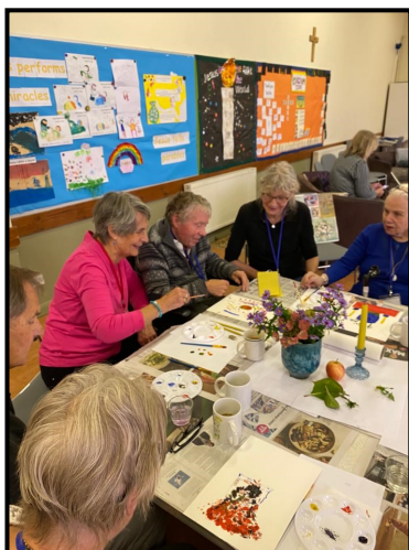
Still life painting by volunteer, carers and guests

The Café aims to improve the wellbeing of its guests and their carers in a social setting where they share interests and experiences and form friendships. The café is in St George's Church in White Lion Road, and is open every Thursday from 10 until 12.