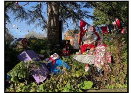
WI display under the triangle Christmas tree

some incredible displays for the village and we hope you enjoy them.