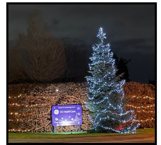
GE Healthcare's tree on White Lion Road