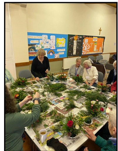
Volunteer with guests, making Christmas posies

Attendees can be referred by their GP or simply ask to come along by calling me on 01494 762395. Guests don't have to have a formal dementia diagnosis to join us.