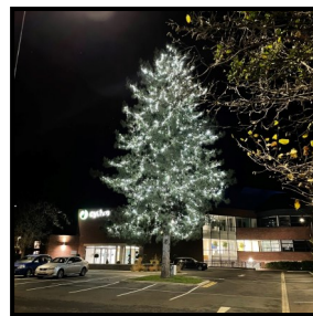
Cytiva's tree before the power failure