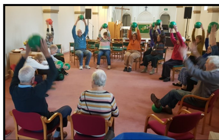
Our very popular exercise class

As the Community Association's Good Neighbours representative, I worked during the pandemic to help local people continue to communicate and the Community Association Chairman asked if I would be willing to set up a dementia Café.