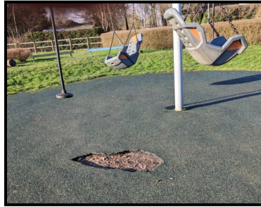
MUGA surface problem

not yet available, but hopefully work will be finished before the start of the summer.