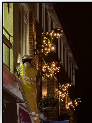
Our engineers putting up the 3' trees on Chenies Parade