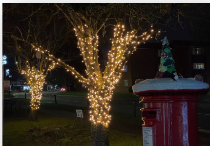
Two of our wrapped tree lights on Chenies Parade

Little Chalfont was looking particularly festive this Christmas. A few photos of Christmas trees around the village: