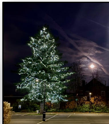
Cytiva's Christmas tree on Amersham Place