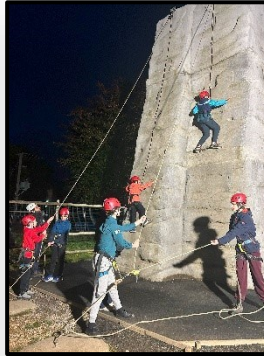
Rock climbing at PACCAR

They then enjoyed PACCAR for a few weeks, doing climbing, zip wire and a gladiator challenge.