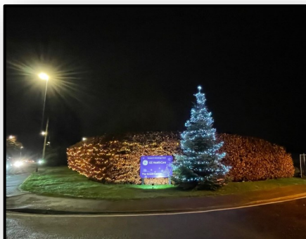
GE Healthcare's tree on White Lion Road