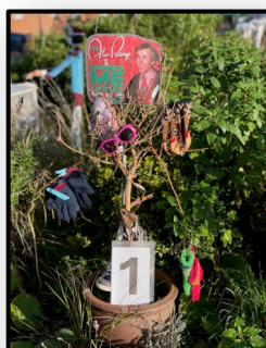
A Partridge in a pear Tree

On November 22 nd we held our annual Christmas Fayre in the Village Hall. This included stalls, children's activities and refreshments throughout the morning. There was an excellent attendance from babies upwards and a very friendly atmosphere which set the scene for the run up to Christmas. We would like to