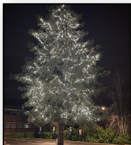
Cytiva's Christmas tree on Amersham Place