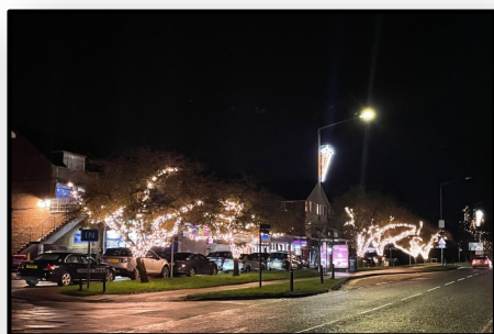
View of Chenies Parade with wrapped trees

Little Chalfont was looking particularly festive again this Christmas with the new tree wrapped lights.