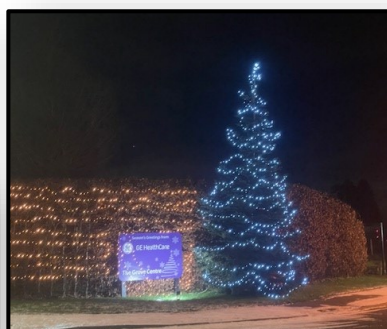
GE Healthcare's tree on White Lion Road