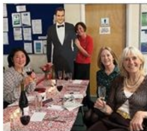
Our Ladies Club Supper Dec 2025 (with special guest!)

We have 6 well-maintained outdoor courts (2 with flood-lights) a practice wall and a modern clubhouse.