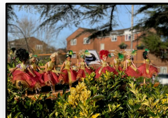
Nine ladies dancing

displays for Black History Month, Remembrance Day and Christmas. The 12 Days of Christmas display was a 'tongue in cheek' interpretation and survived the wet weather remarkably well. A Swan is the county emblem of Buckinghamshire but our 'Swan-a-swimming' disappeared on New Year's Eve and has not been seen since.